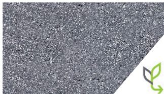
LIGHT STEEL GREY BLEND