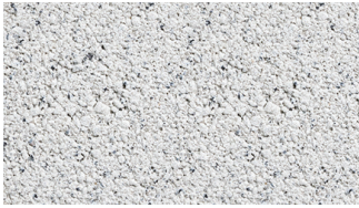
FROST (SRI 68 | SR 0.57)