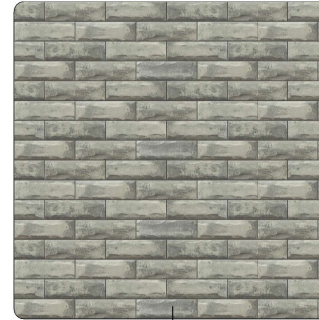
Retaining Wall - Unilock - U-Cara - 18-3/8" x 6" x 2-3/8" - Granite Fusion - Pitched Finish