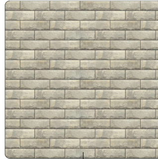
Retaining Wall - Unilock - U-Cara - 18-3/8" x 6" x 2-3/8" - Fossil - Pitched Finish