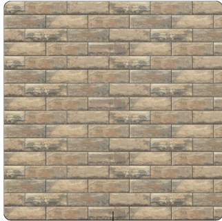
Retaining Wall - Unilock - U-Cara - 18-3/8" x 6" x 2-3/8" - Bavarian - Pitched Finish