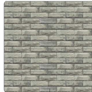
Retaining Wall - Unilock - U-Cara - 18-3/8" x 6" x 2-3/8" - Steel Mountain - Pitched Finish