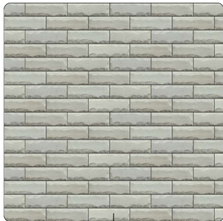
Retaining Wall - Unilock - U-Cara - 18-3/8" x 6" x 2-3/8" - Natutal - Pitched Finish