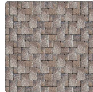
Paver - Concrete - Unilock - Random x 2-3/4" - Pattern W - Brussels Block - Sierra - Tumbled Finish