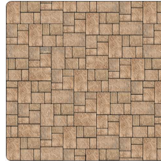
Paver - Concrete - Unilock - Random x 2-3/4" - Pattern AF - Brussels Block - Desert Sand - Tumbled Finish