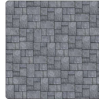
Paver - Concrete - Unilock - Random x 2-3/4" - Pattern AF - Brussels Block - New York - Tumbled Finish