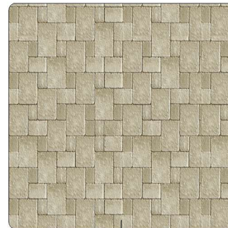
Paver - Concrete - Unilock - Random x 2-3/4" - Pattern W - Brussels Block - Sandstone - Tumbled Finish