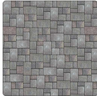
Paver - Concrete - Unilock - Random x 2-3/4" - Pattern AF - Brussels Block - Coffee Creek - Tumbled Finish