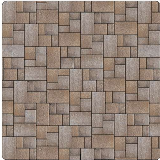
Paver - Concrete - Unilock - Random x 2-3/4" - Pattern AF - Brussels Block - Almond Grove - Tumbled Finish